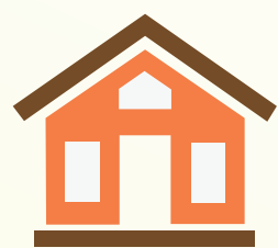
Houses with little to no AC